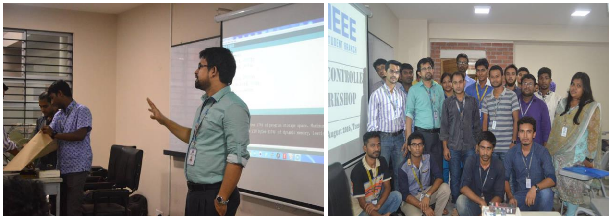
Seminar in Progress