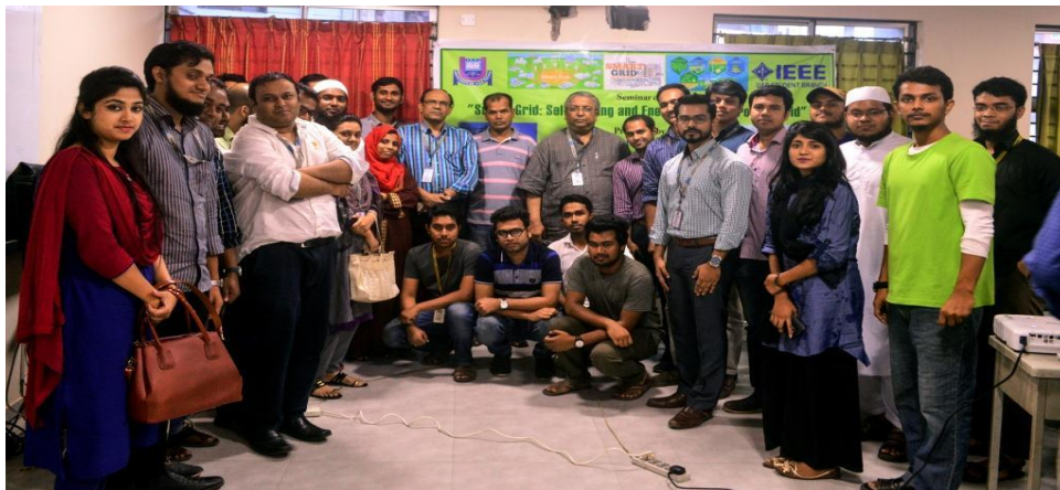
Faculty of EEE with Keynote Speaker