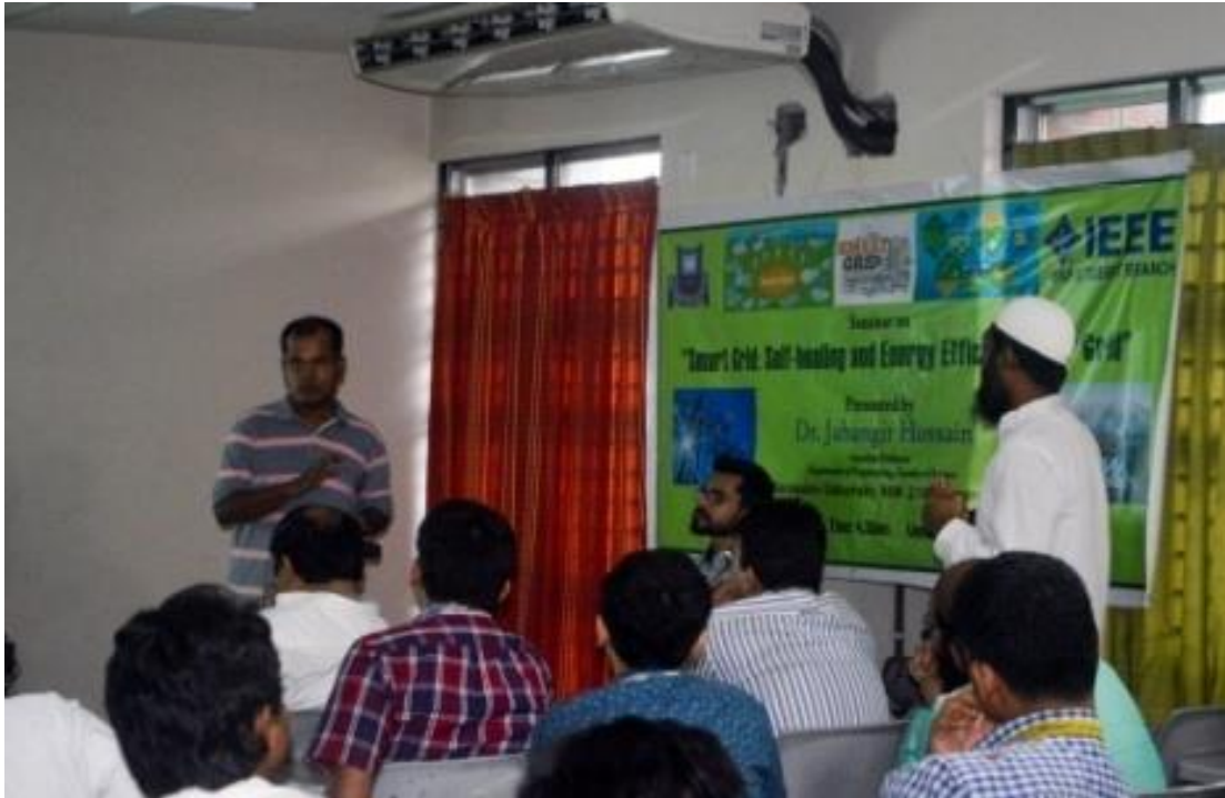
Question and Answer Session