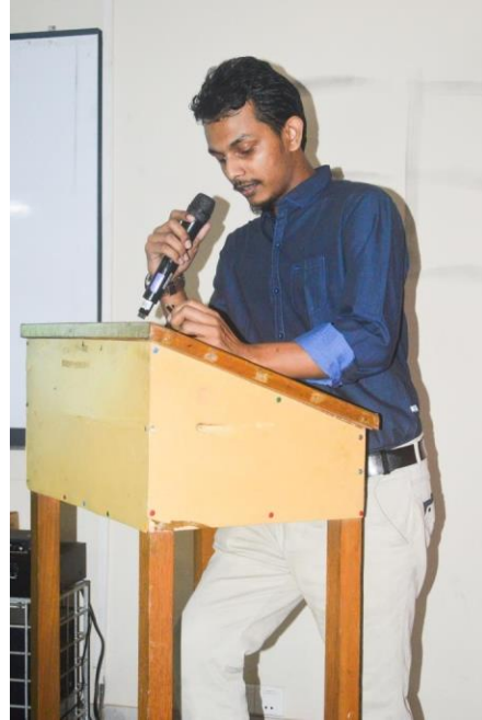
Branch Chair addresses seminar Speaker