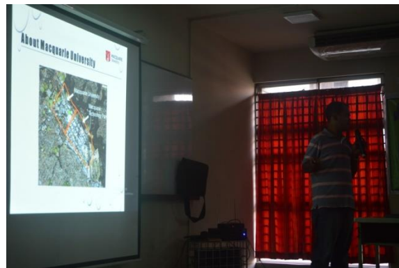
Seminar in Progress